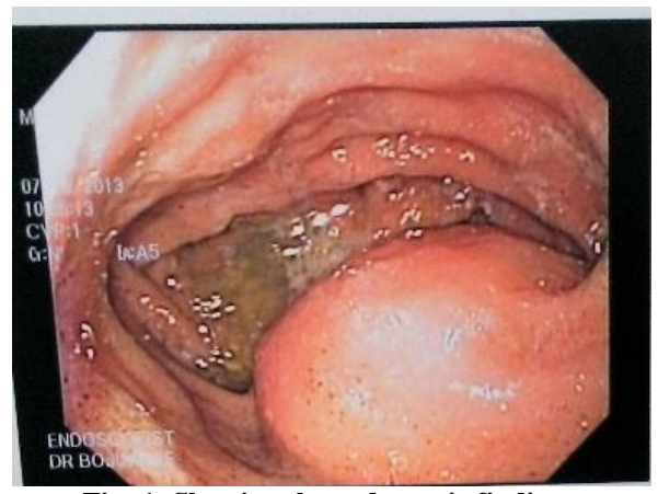
Fig- 1: Showing the endoscopic findings

Our patient was a 63 year old man who routinely attends medical outpatients' clinic of our hospital, as a known hypertensive and diabetic patient with previous history of cerebrovascular accident he suffered three years earlier and recent onset of dyspeptic like symptoms. Further evaluation of the patient was in keeping with clinical diagnosis of acid peptic disease to rule out gastric cancer. Based on the clinical diagnosis, an upper gastrointestinal endoscopy was ordered for, the result of which was in keeping with antropyloric mass with mucosa effacement over the mass (figure 1)