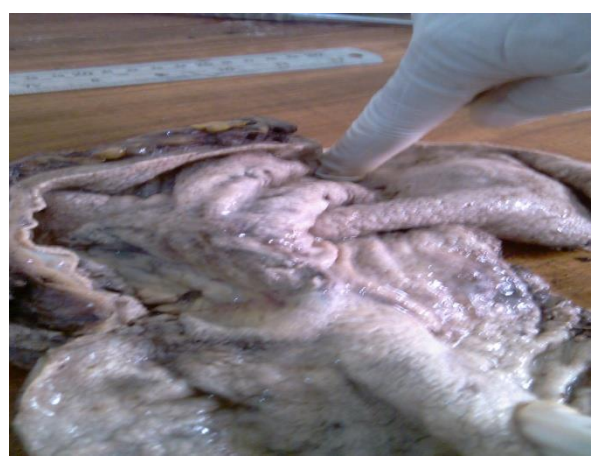
Fig-2: Showing the gross specimen of the tumour