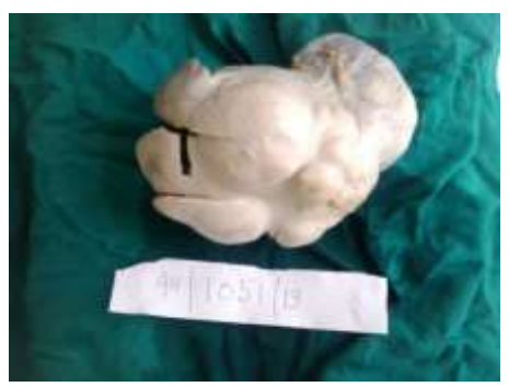
Fig. 1: Gross photograph of ovarian mass