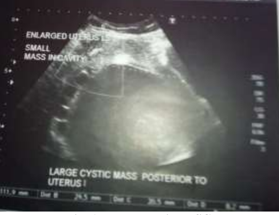
Fig. 1: Pre-operative USG

Patients discharged on 6 post of day. Post operative period was uneventful after six month followup patient was asymptomatic. CECT abdomen showed no abnormality in uterus and pelvis and no other cystic lesion in solid viscera and abdomen.