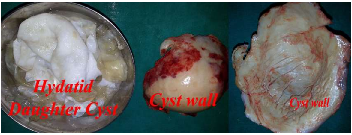
Fig. 4: Hydatid Daughter cyst and cyst wall