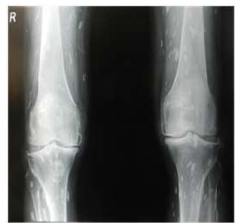
Fig. 1a and b: Plain radiographs of the lower limbs showing extensive involvement of the subcutaneous tissues and muscles