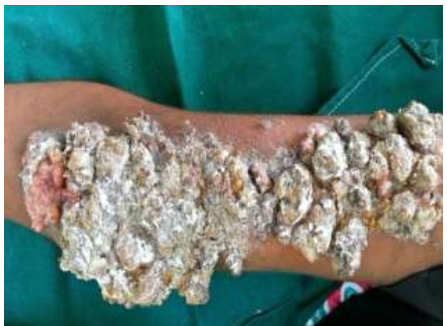
Fig. 1: Giant verrucous plaque with dirty yellow crusting on left arm of the patient