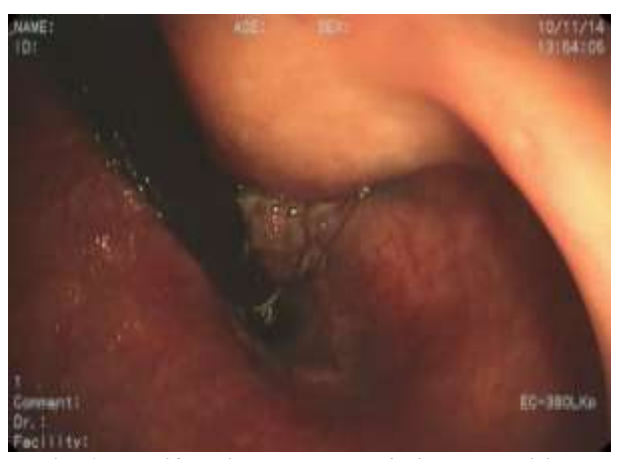
Fig. 1: Proliferative growth at 4 o'clock position involving the one third circumference of anorectal region