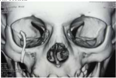
Fig. 2(a): 3 D CT orbit no bony injury

Fig. 1: Photograph of the patient showing fishhook penetrating the central cornea