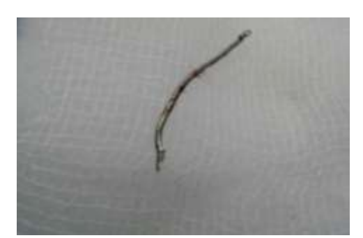
Fig. 3: Completely removed barbed fish hook from right eye

Fig. 2 (b & c): showing metallic foreign body in right eye globe reaching up to anterior chamber