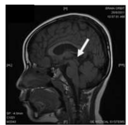
Fig. 2: Sagittal midline T1-weighted MRI images show pineal cyst measuring 8mm (white arrow)