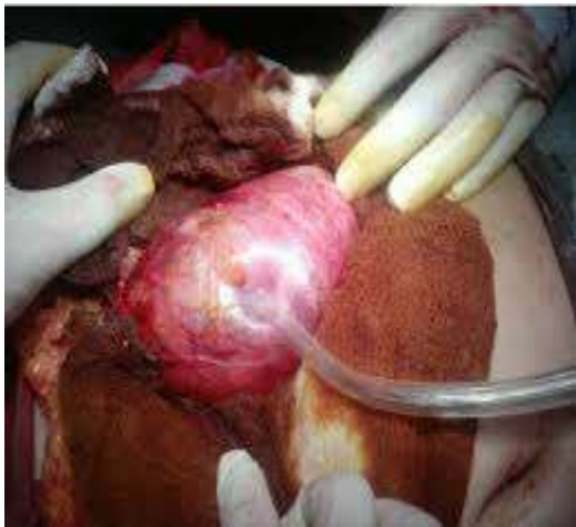
Fig. 2: Intraoperative picture showing enlarged spleen with cystic lesion

After complete pre-anaesthetic examination, the patient was taken for elective laparotomy. Midline skin incision was given and peritoneum opened. Intra abdominal packing was done so thats if cyst reptures then spillage of contents could be avoided to prevent anaphylaxis. After all ligaments were cut and hilum was tied, en-bloc excision of spleen with hydatid cyst was done (Fig. 2). Cut section of cyst showed multiple daughter cyst with fluid. Specimen was sent for histopathological examination and confirmed to be hydatid cyst of spleen caused by Echinococcus species with scolex and hooks. Albedazole that was started pre operatively to reduce infectiveness of fluid was continued post operatively for 2 months.