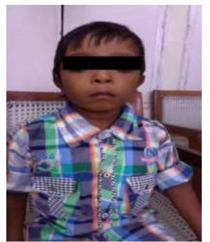
Fig. 1: Seven year old male with dysmorphic face

A 7 year old male child presented to the pediatrics outpatient department with complaints of easy fatigability and abdominal distension for past 6 months. He had dysmorphic facial features.