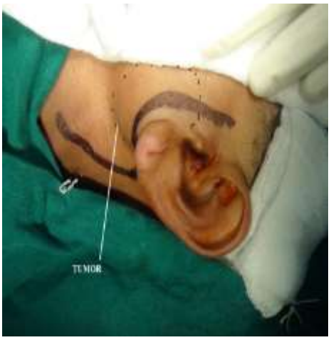
Fig. 1: Parotid swelling