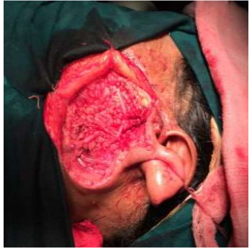
Fig. 3: Facial nerve after superficial parotidectomy