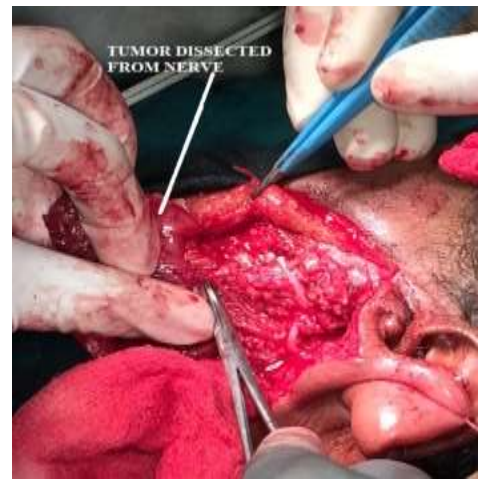
Fig. 2: Tumor dissected from facial nerve