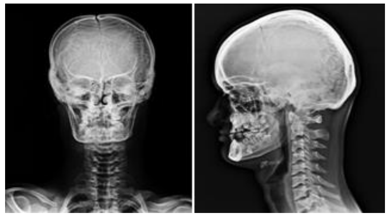
Fig. 6: Posteroanterior view and Lateral cephalogram showing open skull sutures