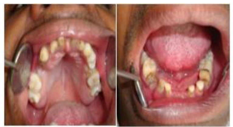
Fig. 4: Introral photograph showing retained deciduous teeth