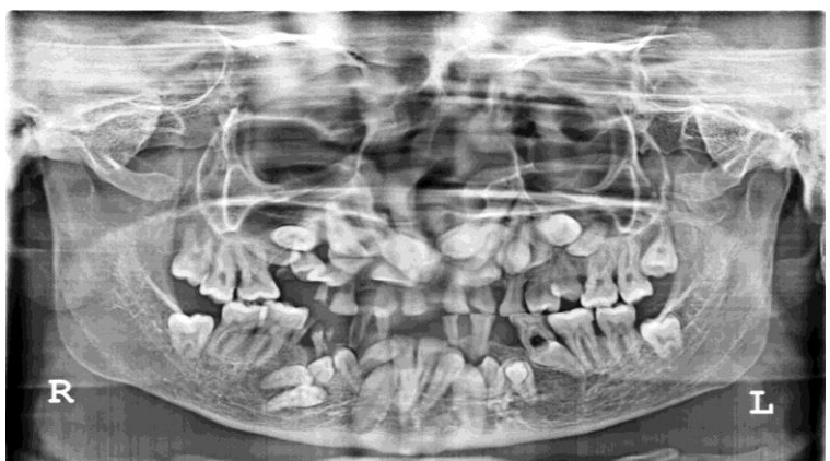
Fig. 5: Panoramic radiograph showing retained deciduous and impacted permanent anterior teeth and supernumerary teeth