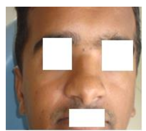
Fig. 3: Extraoral photograph showing wide nasal bridge, hypertelorism