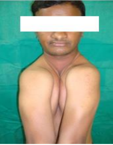
Fig. 1: Photograph showing more than normal mobility of the shoulder girdle

A multidisciplinary dental approach involving oral and maxillofacial surgeons, prosthodontist was followed in our case. Written informed consent was obtained from our patient's parents for publication of this case report and any accompanying images.