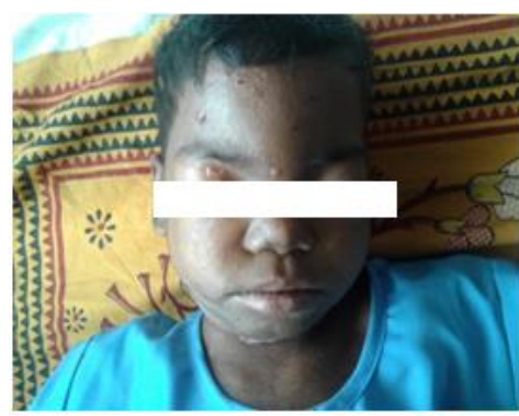
Fig. 1: Vesicular skin lesions on face