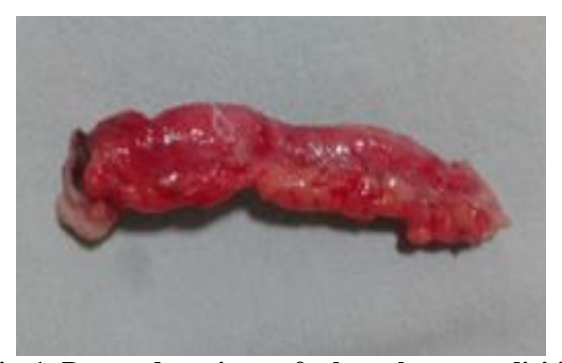
Fig. 1: Resected specimen of tuberculus appendicitis