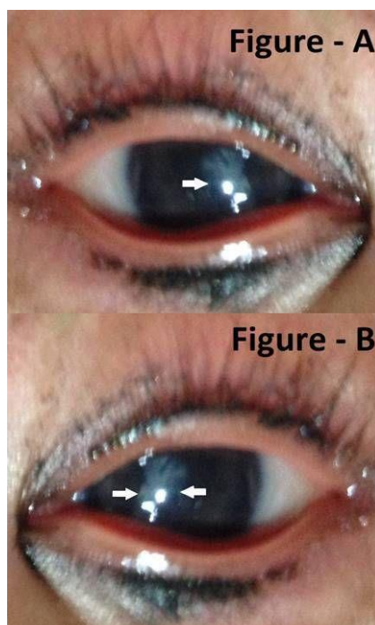
Fig-1A & 1B: Bilateral nuclear cataracts, as shown with arrows.

On 4 th day of life, the neonate was admitted with respiratory distress requiring supplemental oxygen. Subcostal and intercostal retractions were also evident. On examination pre-cardial activity, bounding peripheral pulses, tachycardia, pan systolic murmur and hepatosplenomegaly were noted, suggesting congenital heart defect, possibly PDA. Co-incidentally, the ophthalmological examination revealed bilateral nuclear cataracts (as shown in fig-1A and 1B) alongside cryptorchidism implying congenital rubella syndrome (CRS) for which the neonate was investigated.