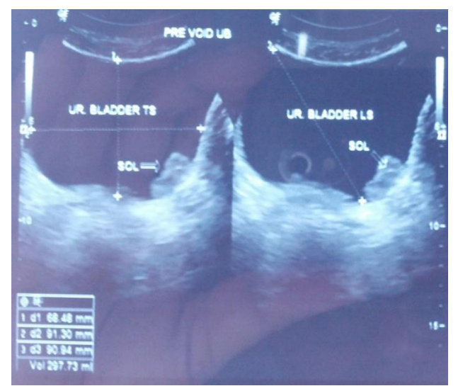
Fig-1: Ultrasonography of Urinary bladder showing a growth in left wall.

multiple tubule like structures lined by cuboidal epithelial cells with round nuclei and mildly eosinophilic cytoplasm, which were consistent with a diagnosis of nephrogenic adenoma (Fig. 2A & 2B). Post operatively patient is free from any recurrence since last two years and till now is on check cystoscopy regularly at six months interval.