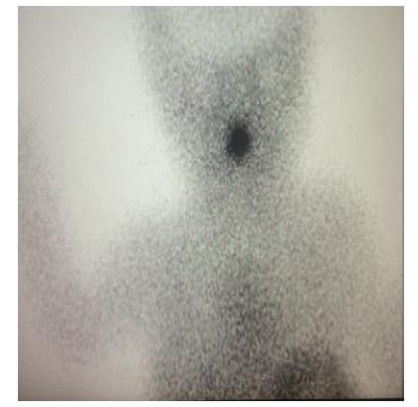
Fig. 2: Technetium (Tc) 99m thyroid scan showing, a homogeneous gland with high uptake of 27% (normal; 0.5-4%)