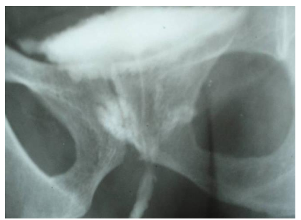
Fig-3: Retrograde urethrography showing pan anterior urethral stricture.

Laboratory investigations were within normal limits. Uroflowmetry showed box shaped curve with maximum flow rate 4 ml/s. Ultrasound of both the kidneys were normal. Bladder wall was thickened with significant post void residual urine. Retrograde urethrography suggested pan anterior urethral stricture [Fig-3].