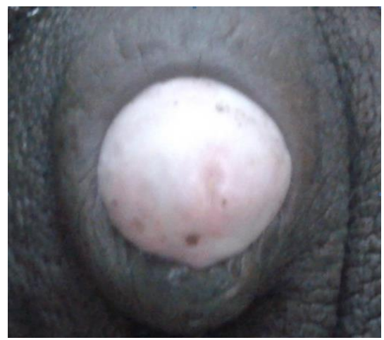
Fig-2: White, xerotic glans with stenosed meatus.

Laboratory investigations were within normal limits. Uroflowmetry showed box shaped curve with maximum flow rate 4 ml/s. Ultrasound of both the kidneys were normal. Bladder wall was thickened with significant post void residual urine. Retrograde urethrography suggested pan anterior urethral stricture [Fig-3].