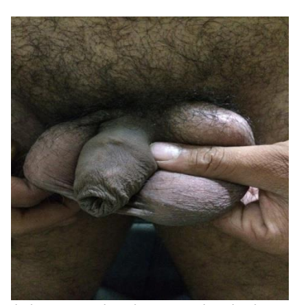
Fig-1: clinical examination showing ipsilateral dual testes

imaging. Post contrast images reveal heterogenous enhancement of the lesion (Figure 2). On exploration, approximately 4 cm nodular, white glistening mass in the left supratesticular region was found which was easily excised from surrounding structures (Figure 3). The histopathology revealed circumscribed nodule containing few aggregates of lymphocytes and plasma cells with spindled cells arranged in haphazard pattern in hyalinised and collagenous stroma showing focal calcification (Figure 4). Immunohistochemistry was positive for keratin and vimentin.