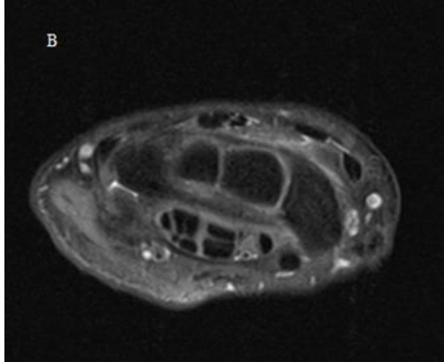
Fig-1: MR images of the left wrist in the axial view in two different sections. Persistent median artery (PMA) and median nerve (MN) are observed in the carpal tunnel.