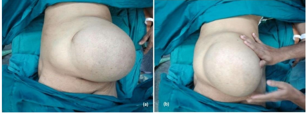
Fig-1: Pre-operative image showing the giant incisional hernia (a) end on view and (b) propped up hernia sac

occurs secondary to returning the hernial contents into the abdominal coelom. With the use of the second prosthetic mesh and non-approximation of the recti we had provided adequate space for the return of these contents into the abdominal cavity thus providing the "right to housing" and also reducing the risk for atelectasis and respiratory distress. This patient was a known case of COPD with an increased risk of atelectasis and respiratory failure secondary to corrective surgery (Chevrel's technique), however our novel technique was able to overcome these grave complications and provide the patient with an uncomplicated postoperative period. She did not require postoperative ventilation and this reduced the risk of ventilator-associated pneumonia (VAP) and other morbidities, which are usually associated with these patients.