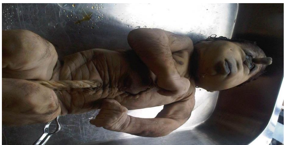
Fig 1: Cyclop showing a single central slit-like orbital grove possessing two eyes with a superiorly attached blindending proboscis, absent nose, and well-formed mouth.