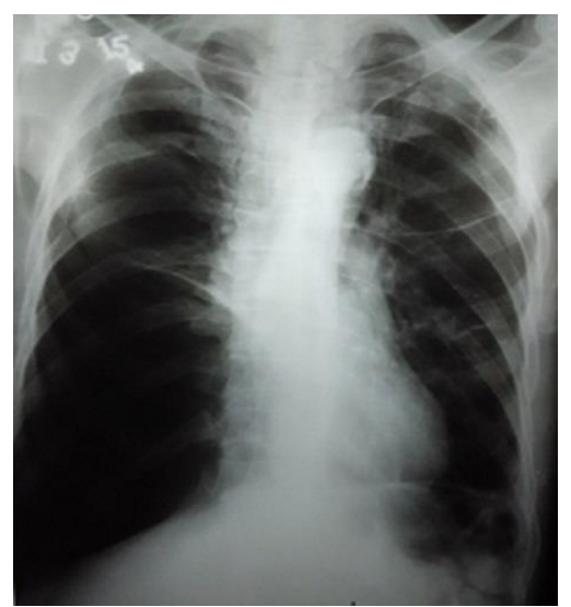
Fig 1: Chest Radiography showing hyper transradiancy with absence of vascular markings on right lower lobe with mediastinal shift to left side

was 41% of predicted, DLCO 32% of predicted, RV/TLC 184% of predicted, and due to severe impairment of pulmonary functions and diseased underlying lung, patient was managed conservatively.