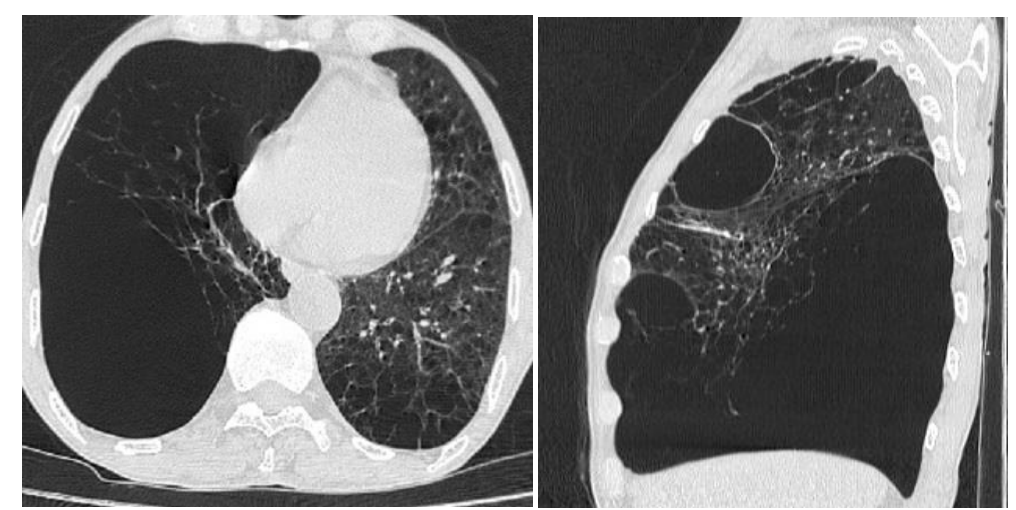
Fig 2: CT Thorax showing bilateral bullous lung disease with giant bullae on right lower lobe (in sagittal section)