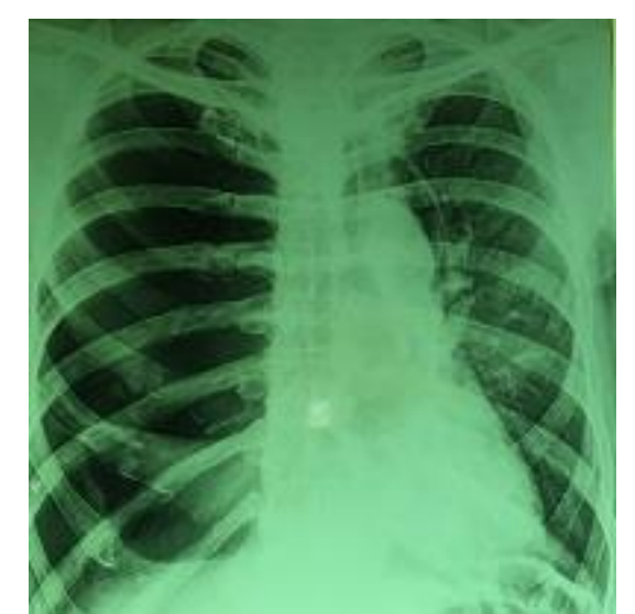
Fig 3: Chest radiography showing large hyperluscent area over the entire right hemi thorax.