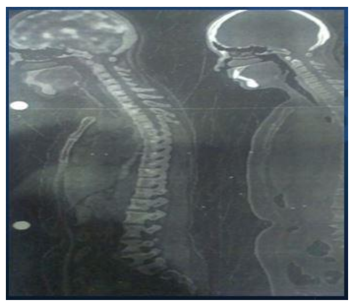
Fig-2: FDG-PET scan showing focal increased FDG uptake in bilateral temporal lobes – parahippocampal region consistent with LE; no other FDG avid lesion anywhere on whole body survey to suggest occult primary malignancy

symptoms of acute psychosis. Considering para neoplastic etiology as a cause for LE, a search for primary neoplasm was undertaken. Contrast-enhanced Computerized Tomography (CECT) of the abdomen and pelvis, upper gastrointestinal endoscopy (with biopsy), echocardiogram, ultrasonography (USG) thyroid and mammogram were normal. CT thorax showed two old calcified lymph nodes measuring less than 1.5 cams in pretracheal region. Fluorodeoxyglucose – Positron Emission Tomography (FDG-PET) scan showed focal increased FDG uptake in bilateral temporal lobes – parahippocampal region consistent with LE (Fig. 2) but no other FDG avid lesion anywhere on whole body survey to suggest occult primary malignancy.