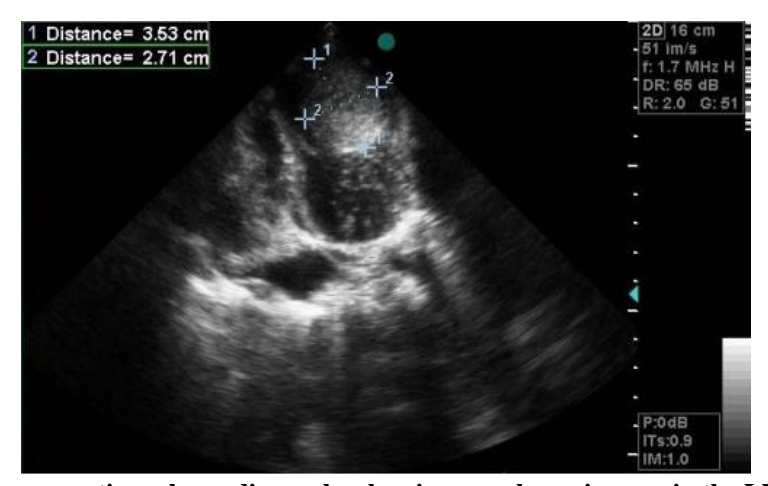
Fig-1: preoperative echocardiography showing an echogenic mass in the LV apex.

months prior , was admitted to emergency room for poorly tolerated ventricular tachycardia (VT), reduced with external cardio version . On physical examination she had normal vital signs and no abnormal clinical findings. Electrocardiogram showed negative T waves in anterior leads. Chest radiograph showed a normal heart shadow with cardiothoracic ratio at 0.5 and no calcifications over the cardiac silhouette. Cardiac Ultrasonography found a 33 X 26 mm echogenic mass. It is located in the apical segment of the anterolateral wall of the left ventricle (LV), bulging in its apex without causing any obstruction.