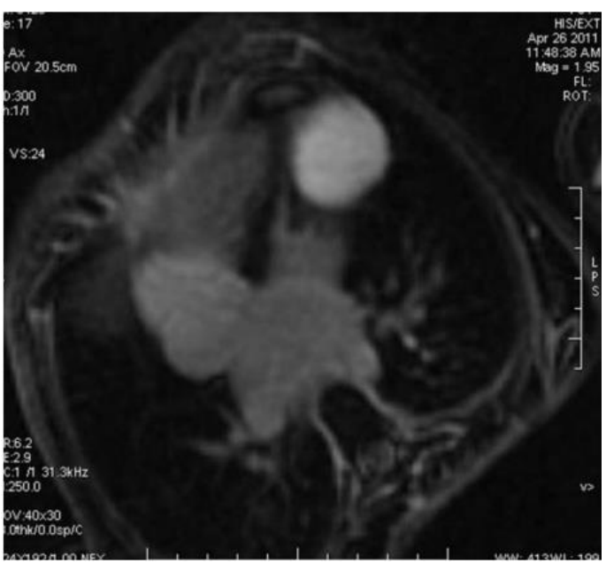
Fig-2: preoperative cardiac MRI. Note the well defined borders of the tumor.

Surgical resection of the tumor was performed under moderate hypothermia cardiopulmonary bypass with antegrade warm blood cardioplegia. Epicardial incision was performed over the tumor site and dissection went through a good cleavage layer. Total tumor removal was performed through normal muscle margins. The LV lumen was partially opened during