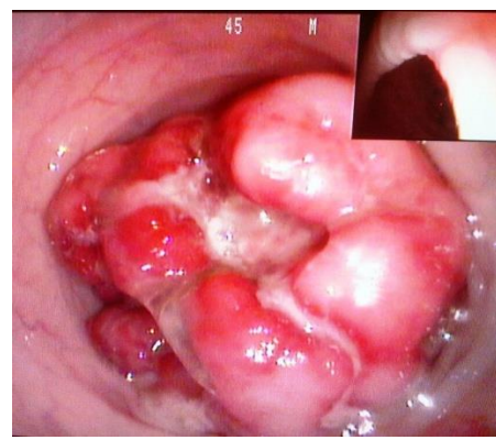
Fig-2: Colonoscopy shows a polypoidfungating growth in the descending colon.