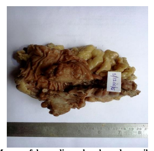
Fig-3: Mucosa of descending colon showed a sessile polypoidal growth, grayish white in color and firm to mucinous in consistency.