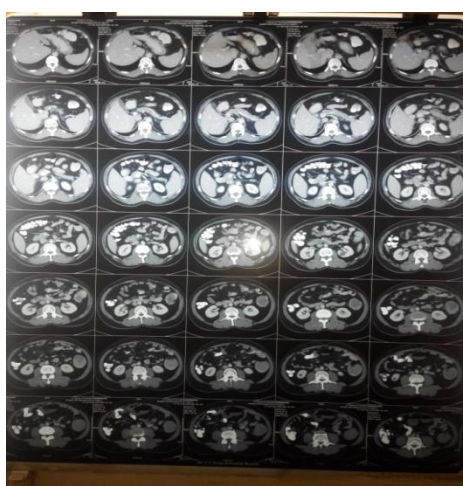
Fig-1: Contrast Enhanced CT scan of abdomen shows a sessile polypoidal lesion in the descending colon along with small transient colo-colonic intussusceptions

length along with mesentry measuring 13x5x2.5 cm. Serosa was unremarkable. On cutting open, mucosa showed a sessile polypoidal growth measuring 4.2x3.6x3.5 cm. On the external surface of the growth focal ulceration was seen. The cut surface of the growth was grayish white in color and firm to mucinous in consistency (Fig-3). The mesentry was unremarkable. Single lymph node was dissected from the mesentry at the level of tumor which appeared unremarkable. Microscopy of the tumour showed diffuse infiltration of lamina propria and muscularis with tumor cells having signet ring cell morphology. Few of the signet ring cells show intracellular mucin deposition. Mucosa and serosa were unremarkable (Fig- 4a,b,c). The lymph node showed no involvement by tumour cells. This case was reported as Primary Signet cell carcinoma of descending colon. The TNM staging was done as T2N0Mx (Stage I) and graded as Grade 3.