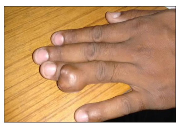
Fig 1: Location of the swelling

A 21 year old male presented with swelling over the left ring finger since 2 years. It was gradually increasing in size with no other complaints. On examination, there was 3×2 cm swelling over the dorsal aspect of the left ring finger. It was not tender, soft to firm in consistency, not freely mobile and skin over the swelling was free. Fine needle aspiration cytology revealed cluster of spindle cells and round oval cells with eccentric nucleus & moderate amount of cytoplasm with many multinucleated giant cells suggestive of giant cell lesion of soft tissue. Patient underwent excision. Histopathology report shows mass composed of interlacing & intersecting fascicles of smooth muscle cells arranged in whorled pattern. Cells exhibit mild to moderate nuclear pleomorphism, few bizarre cells & occasional mitotic figures. Many dilated & congested vessels, areas of hemorrhages, skeletal muscle fibres and large area of necrotic debris are seen. Histological features suggestive of Giant cell tumour arising from soft tissue. (Figure 1 & 2)