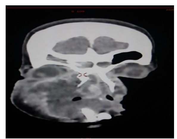
Fig 2: Contrast CT picture showing soft tissue mass involving the maxillary sinuses with destruction of hard palate and extension into the oral cavity

perforation of hard palate with extension into the oral cavity and also extending to the right orbit (Fig. 2).