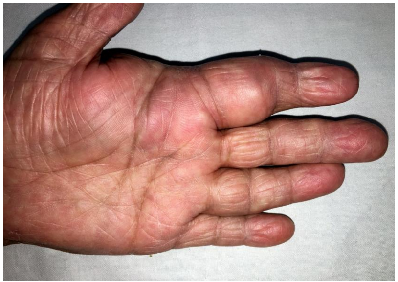
Fig-1: Tenosynovitis of flexor tendon of left index finger

On clinical examination, a hard swelling was noted in volar aspect of left index finger (figure 1).