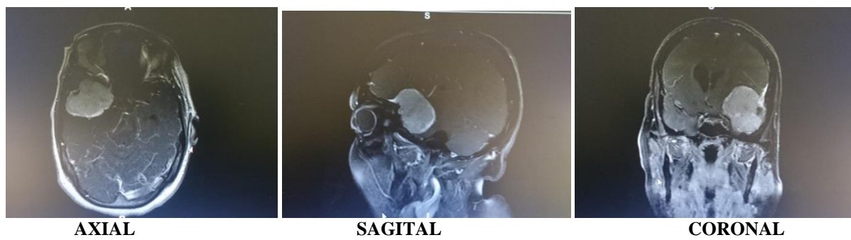
PRE OPERATIVE T 1 WEIGHTED CONSTRAST