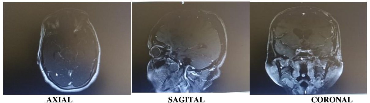
SAGITAL POST OPERATIVE T 1 WEIGHTED CONSTRAST