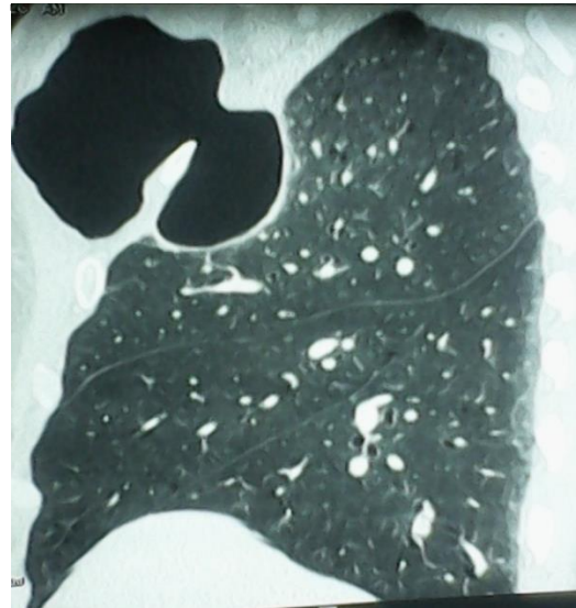
Fig 3: Pneumatocele as showed by the para-sagittal chest CT