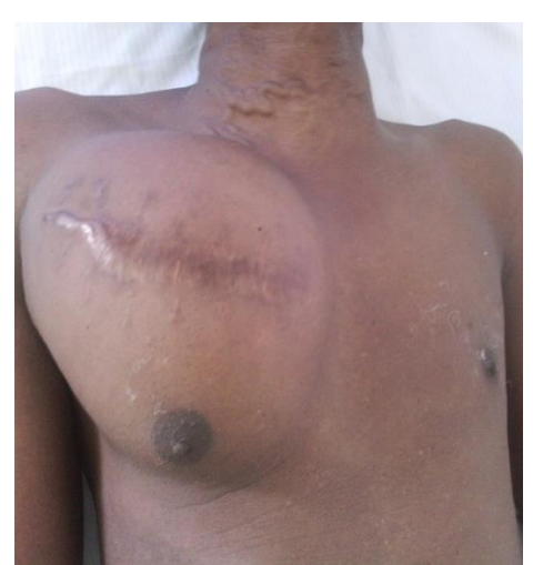
Fig 1: Pectoralis large bulge along the right mediastinotomy scar, with collateral circulation.