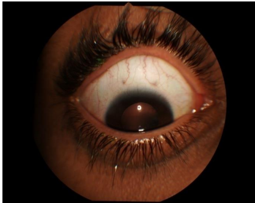
Fig-2: Healed shield ulcer