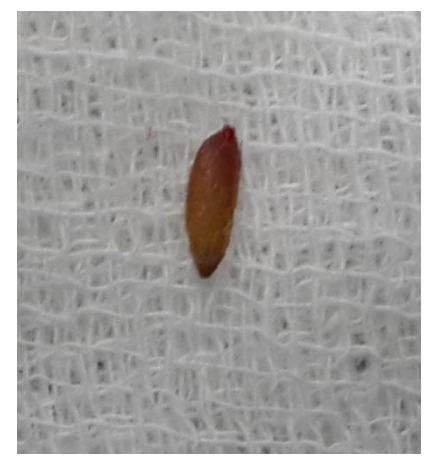
Fig.2: Paddy grain removed from the urinary bladder.

For removal of the grain we arranged for cystoscopy under general anaesthesia which confirmed the diagnosis (Fig-1) and localised the site of the grain. Finally with tripong forceps the grain was removed in toto (Fig-2). Patient was discharged on next day. He was sent to the child guidance clinic for assessment of psychological evaluation which didn't reveal any abnormality.