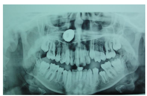
Fig-2: In panoramic radiography showed opaque foreign body with metal opacity in the floor of the nose