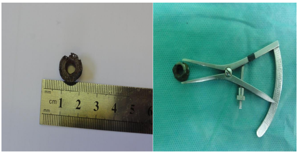
Fig-4: 1×1 cm metal nut was removed from the nose. Note the corrosion of the metal around the foreign body