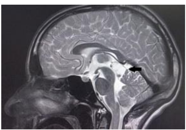
Fig-2: Sagittal T2WI section of the same patient shows another bubbly cystic mass lesion (black arrow) expanding the tectal plate