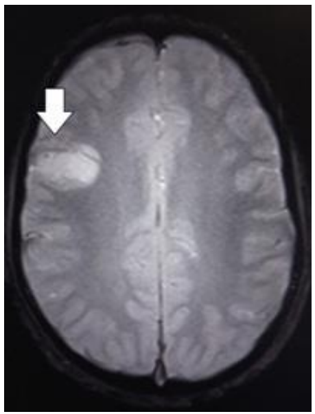
Fig-3: Axial DWI sectional the level of the right frontal lesion shows no significant diffusion restriction (white arrow)