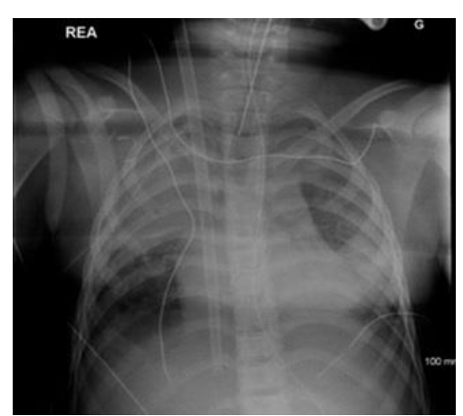
Fig-2: Vv (Venovenous) Ecmo Day 5