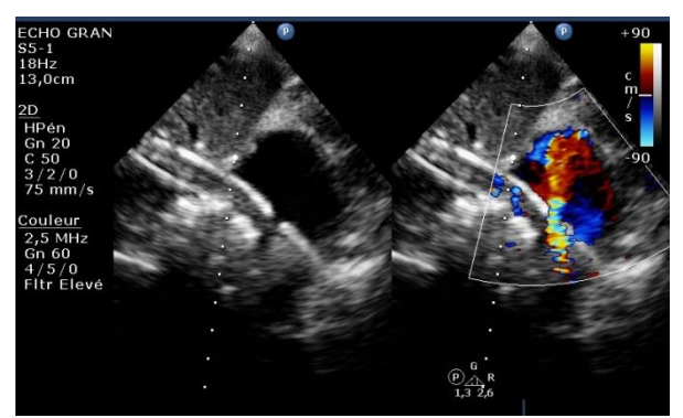
Fig-3: Avalon Elite® Bi-Caval Dual Lumen Cannula n°19 in the right jugular (red arrow)