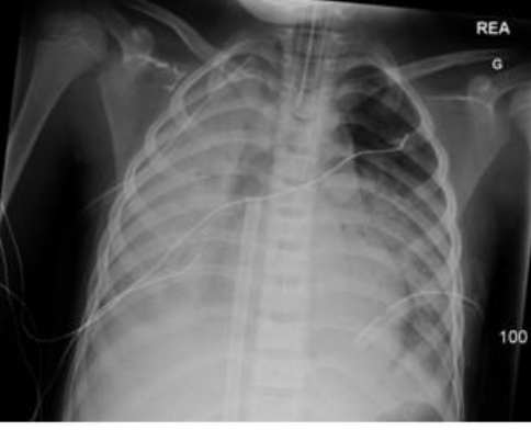
Fig-1: Va (Veino arterial) Ecmo Day 2

Mechanical ventilation was stopped after one week; she was discharged at home 2 months after her admission. After 12 months on Follow-up, she has a good clinical state, without respiratory insufficiency and normal neurological outcome.