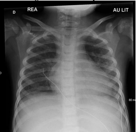
Fig-6: Day 40(Vv Ecmo weaned)