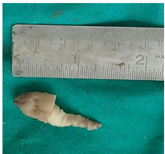
Fig-1: Lymphangiomatous polyp, gross appearance

A soft, elongated, intact polypoid mass of measurement 4x1.2x0.8cm was found. Externally congested, cut surface was edematous with gray white speckles. The representative tissue was processed.