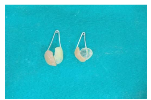
Fig-4: Ear pressure clips of right and left sides