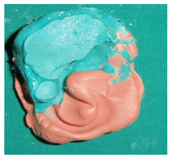
Fig-2a: Impression of the right sided auricle

polyvinylsiloxane to prevent distortion(Figure 2a). Slight difficulty was experienced while removal of the impression attributing to the shape and dimensions of the swelling. So, it was decided to make a sectional impression for the other side. A sectional impression was made using alginate (Algitex, DPI, India) reinforced with plaster backing (Figure 2b). The casts were fabricated in dental stone (Kalstone, Kalabhai Mumbai, India).