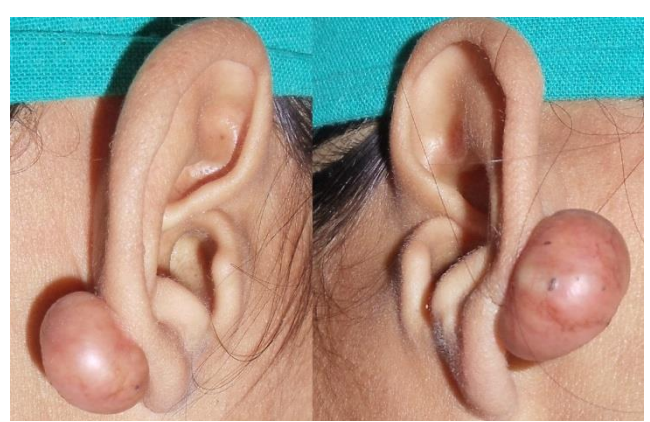
Fig-1: Keloid present w.r.t. ear lobe on right and left sides