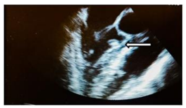
Fig-1: Intraoperative transoesophageal echocardiogram showing mass beneath the right aortic cusp.

through a J sternotomy cardiopulmonary bypass. Intraoperative transesophageal echocardiography was performed to detect the location of the mass (Figure 1). Transverse aortotomy was performed 2 cm above the coronary arteries. The mass was attached beneath the right coronary aortic cusp which was seen easily by the help of 5 mm endoscope. The lesion was treated successfully by total surgical excision. Cross clamp time was 30 minutes and cardiopulmonary bypass time was 40 minutes. The patient had an uneventful postoperative period and was discharged on the 4<sup>th</sup> day after the operation. Macroscopic assessment showed a 1 x 0.8cm ovoid mass of tissue (Figure 2). Haemotoxylin and eosin stained sections demonstrated a prominent papillary network of endothelial cells covering a loose stromal core (Figure 3). The histopathological diagnosis was papillary endothelial hyperplasia.