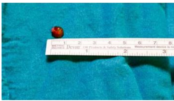
Fig-2: Macroscopic assessment showed a 1X0.8cm ovoid mass of tissue.