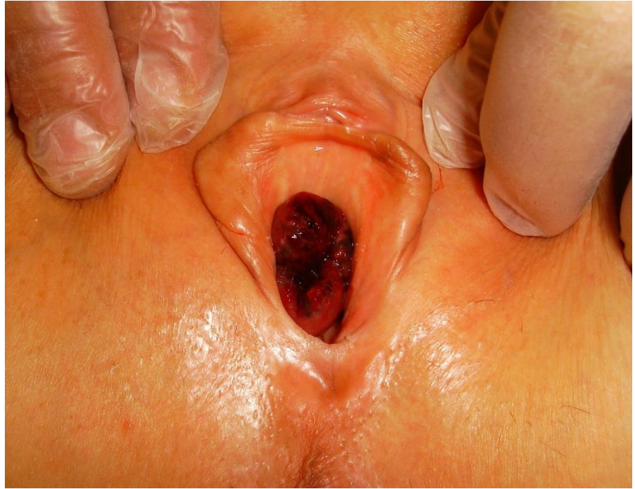
Fig- 1: Edematous appearance of the prolapsed mucosa and mucosal bleeding sites among patchy purple thrombotic areas

A sixty-eight year old white female patient was referred to urology clinics because of haematuria and bleeding from an introital mass. Urogenital examination revealed an approximately 25 mm protruded urethral mucosa with edematous appearance. There were bleeding sites among patchy purple thrombotic areas suggesting strangulation (Figure 1).