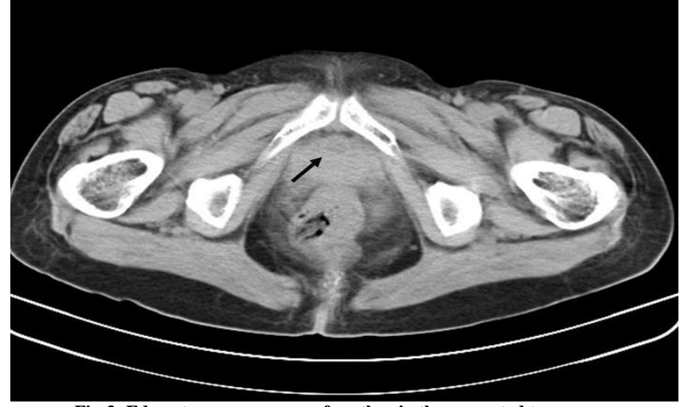
Fig-3: Edematous appearance of urethra in the computed tomogram

under microscopic magnification. The postoperative period was uneventful and the indwelling 20F Foley urethral catheter was removed after a week. Histopathological examination of the specimen revealed stratified squamous epithelium with profuse edematous changes and over-dilated veins beneath the mucosa.