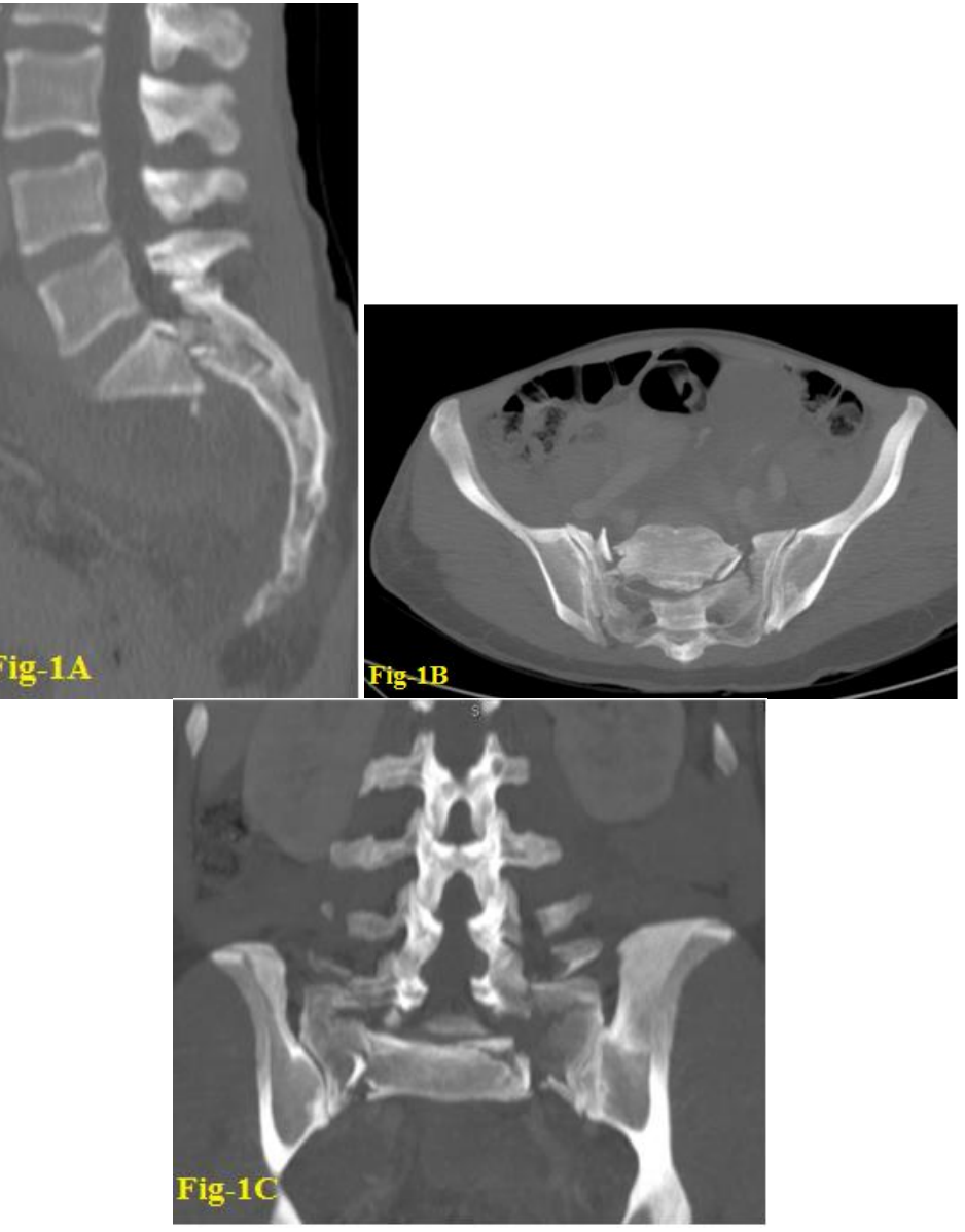
Fig-1: Preoperative CT image of lumbosacral spine in sagittal plane, axial, and coronal showing displacement at S1-S2 level.