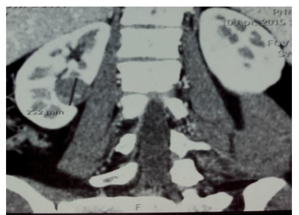
Fig-2: Computer tomography scan showing hypovascular right hilar mass

On gross examination, the tumor measured 2cm x 3cm. It was well-circumscribed and encapsulated. Cut sections presented homogenous gray-