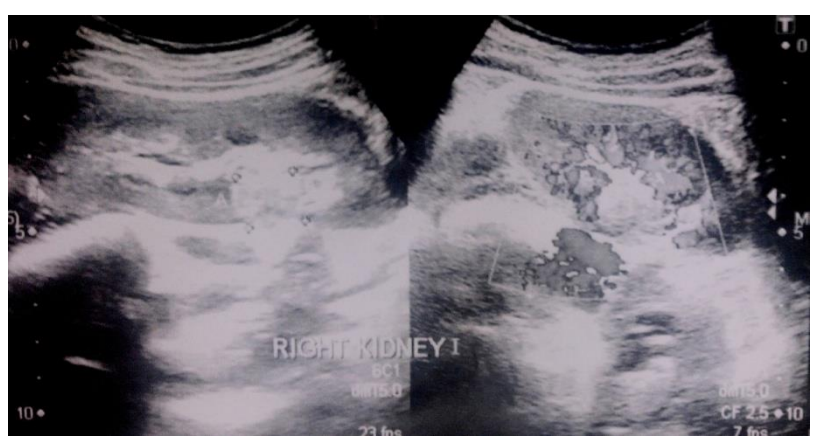
Fig-1: Ultrasonography showing right renal mass

A 22-year-old female came with an incidentally detected 2cm x 3cm right sided renal mass on Ultrasonography [fig1].