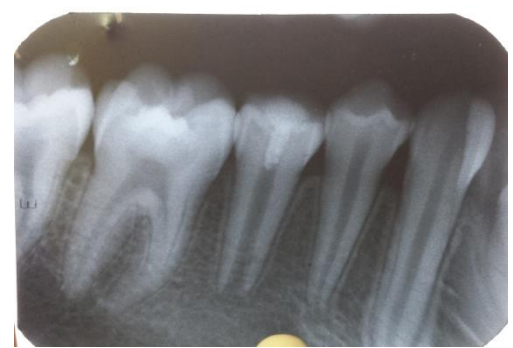
Fig-5: 6 months follow up