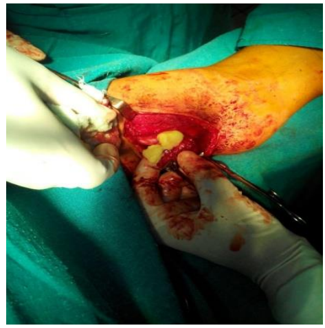
Fig.1: Intra operative image showing caseous cheesy material

During the procedure a capsulated mass was seen abutting the ulnar nerve. To preserve the nerve deroofing was done which revealed thick yellow caseous material.