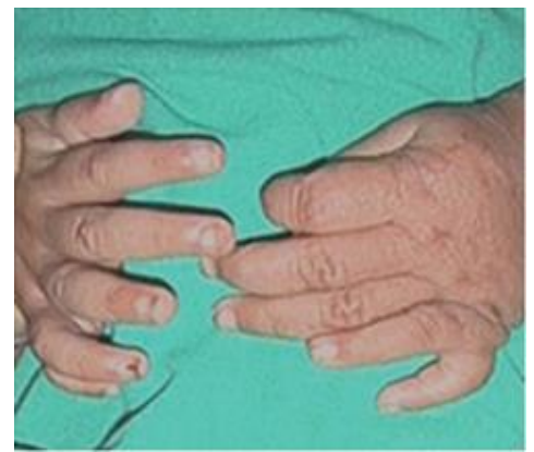
Fig. 1: Postaxial polydactyly in both hands

On general examination child was stable and active. Postaxial polydactyly in both hands and postaxial polydactyly with syndactyly were present in both feet (Fig. 1 & 2).