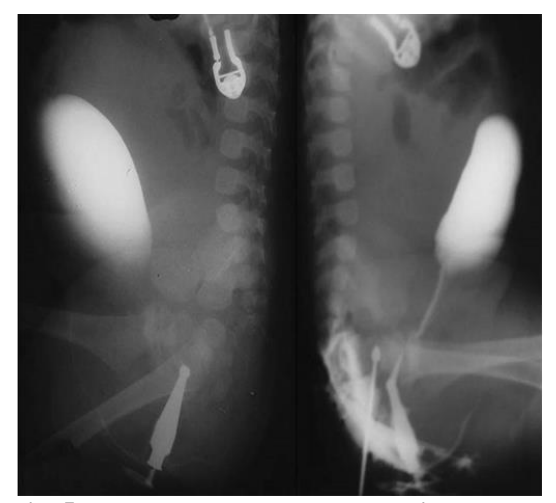
Fig. 5: Intra-op contrast study showing normal bladder

Child was planned for genitoscopy with genitogram and exploratory laparotomy. Genitoscopy revealed single channel which was going anterosuperiorly and ending in the bladder. Bladder could not be distended properly and ureteric orifices were not visualized. Dye study was done which showed single channel leading to bladder with pressure effect from soft tissue shadow posteriorly. There was no evidence of reflux (Fig. 5).