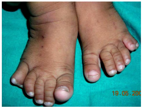
Fig. 2: Postaxial polydactyly and syndactyly in both feet