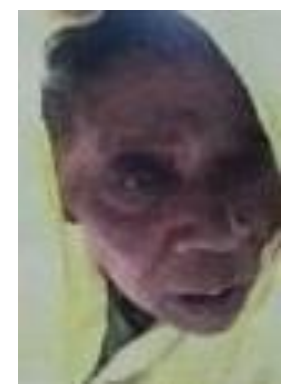
Fig-2: After Surgery