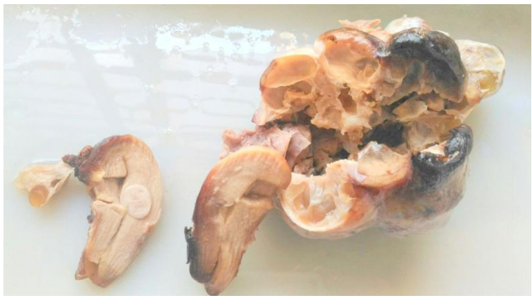
Fig.1: Grossly left ovary showing variable sized multiloculated cyst filled with jelly like gelatinous material; right ovary with minute cyst and myometrium showing a small submucosal fibroid

histologically except a leiomyoma in myometrium. A diagnosis of bilateral benign struma ovarii was made.