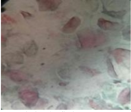
Fig 2: PAP Stain

Lump in male breast, most commonly diagnosed as gynecomastia. It is common breast pathology in male. Presentation is generally unilateral. In our case it