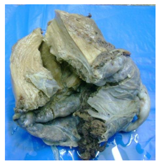
Fig- 3: Hysterectomized specimen of uterus showing presence of placenta percreta (Case no-3)

A second para with two live births, first delivered at term by LSCS two years back and the other vaginally at 35 weeks gestation one hour back, was referred from a local urban hospital with complaints of retained placenta. She had a live preterm baby weighing 2.1kg with an Apgar score of eight in five minutes. On examination she was normotensive and had pulse rate of 86/ minute. Uterus corresponded to 24 weeks size and bleeding per vagina was mild. All antenatal investigations were within normal limits. An ultrasonography done at eight months showed a live fetus at 32 weeks gestation without any birth defect and a normally situated placenta. Under general anesthesia manual removal of placenta was tried but failed and so laparotomy was attempted, suspecting presence of placenta accreta. A rent in the fundus of uterus was observed and placenta was deeply insinuated into its margins (Fig-3). Subtotal hysterectomy was carried out as a life saving procedure and later histopathology proved presence of placenta percreta. Intra-operative blood loss was almost 2.5 liters. At third and sixth months follow up all women were healthy.