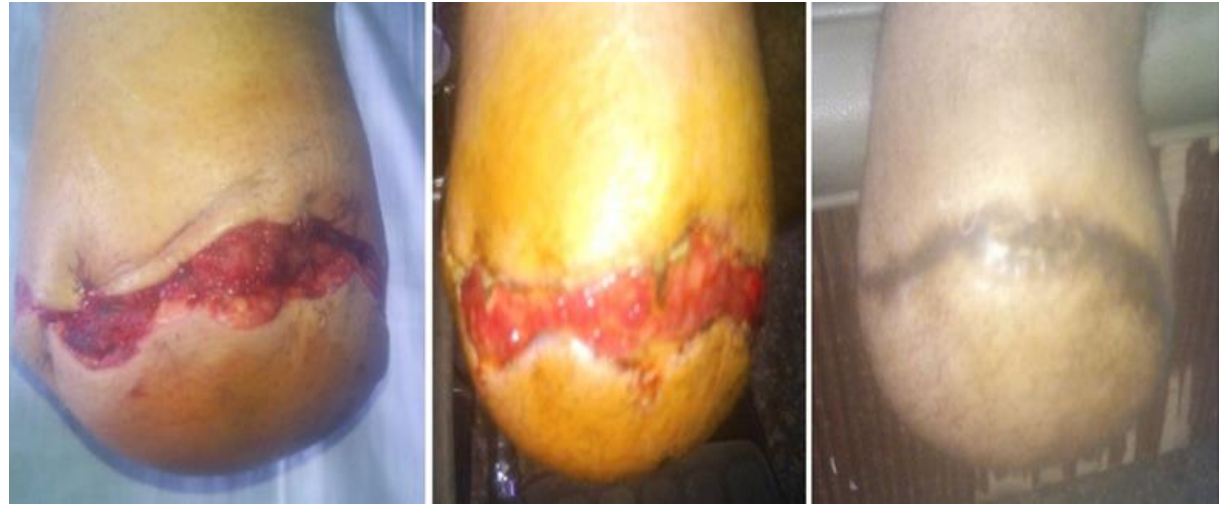
Fig 3: Photos showing the leg amputation with good evolution.

was performed. The evolution was marked by a good healing of the stump with adapted equipment (figure 3).