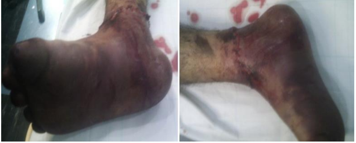
Fig 1: Pre-operative photos showing the strangulation injury along the circumference of the right ankle.

A 24-year-old fisherman, without medical history, was admitted to the emergency department of Avicenne Hospital in Rabat (Morocco), 48 hours after a severe trauma to his right ankle. The mechanism was special: it was a severe ankle trauma by strangulation with a rope from a fishing boat in the Dakhla region. The patient was transported by helicopter to Agadir then to our department for care. The examination at the admission showed an advanced right foot ischemia, with strangulation along the circumference of the right ankle (Figure 1).